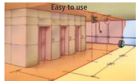
Easy to use