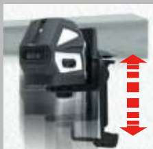
Height and position of the measuring device easily adjustable