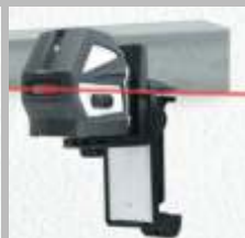
Anchorage point and laser level at one height