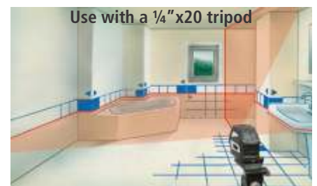
Use with a ¼"x20 tripod