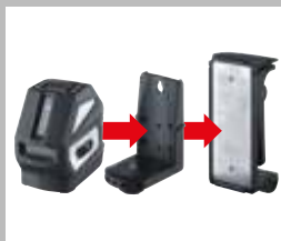
Stand-alone device or in combination: wall- and clamp holder